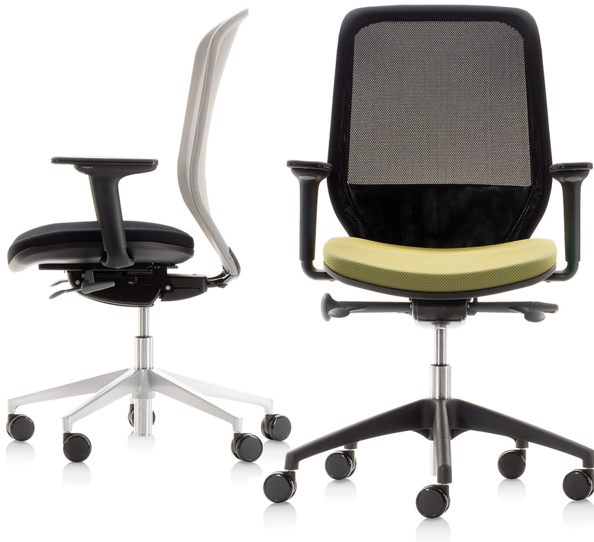
Top - JOY-03 & 04, Bottom - JOY-14