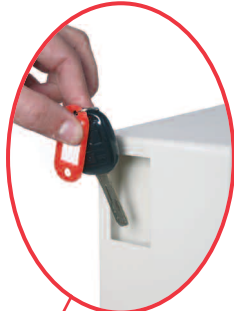
KEY DEPOSIT SLOT