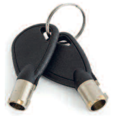
OVERRIDE KEYS KS0030E ONLY