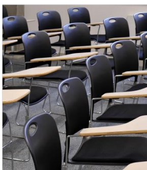
Removable tablet arm (left & right handed)