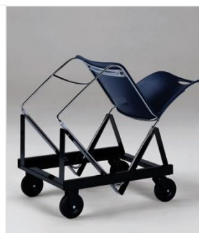
Transport dolly for easy movement of chairs