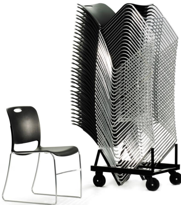
Safely stacks to 38 high on the Maestro transport dolly

NB: All dimensions quoted are approximate