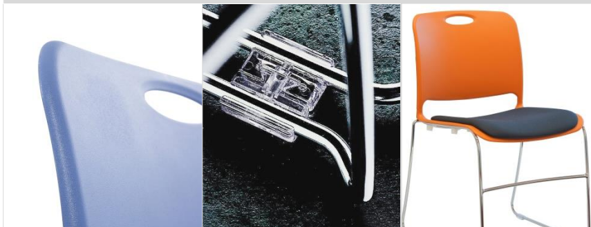
Integrated handle for easy movement