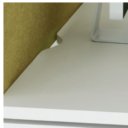
Desktops with a scallop for wire management