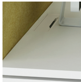
Desktops with a cut-out for grommet and wire management