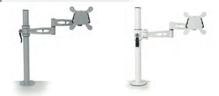
Twin Monitor Arms