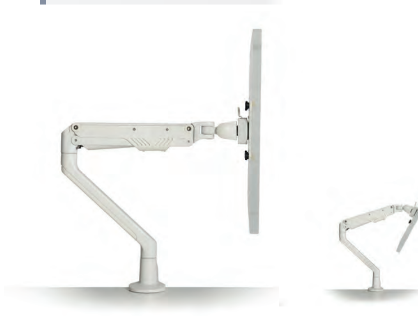
Gas Lift Monitor Arms